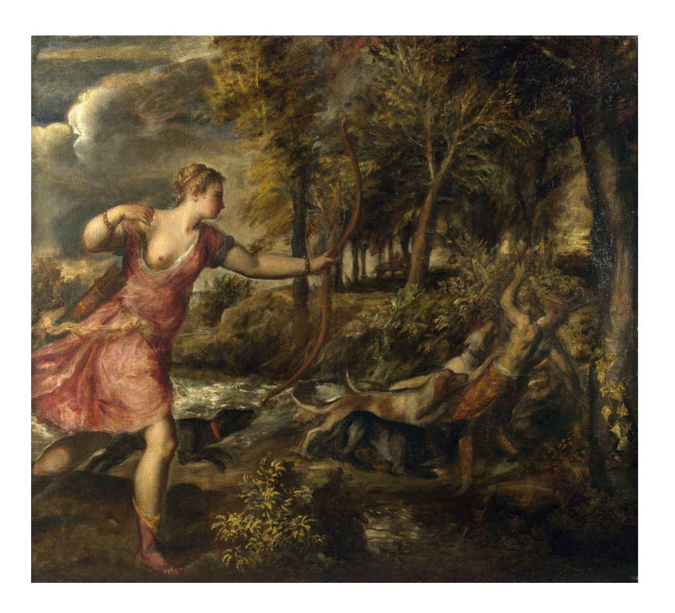
September 29th - 30<sup>th</sup>, 2023

"The Dynamics of Fiction in Renaissance Art, Literature, and History"